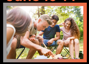
KNOWLEDGE June 24-28