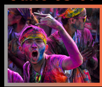
COLOR WARS June 17-21